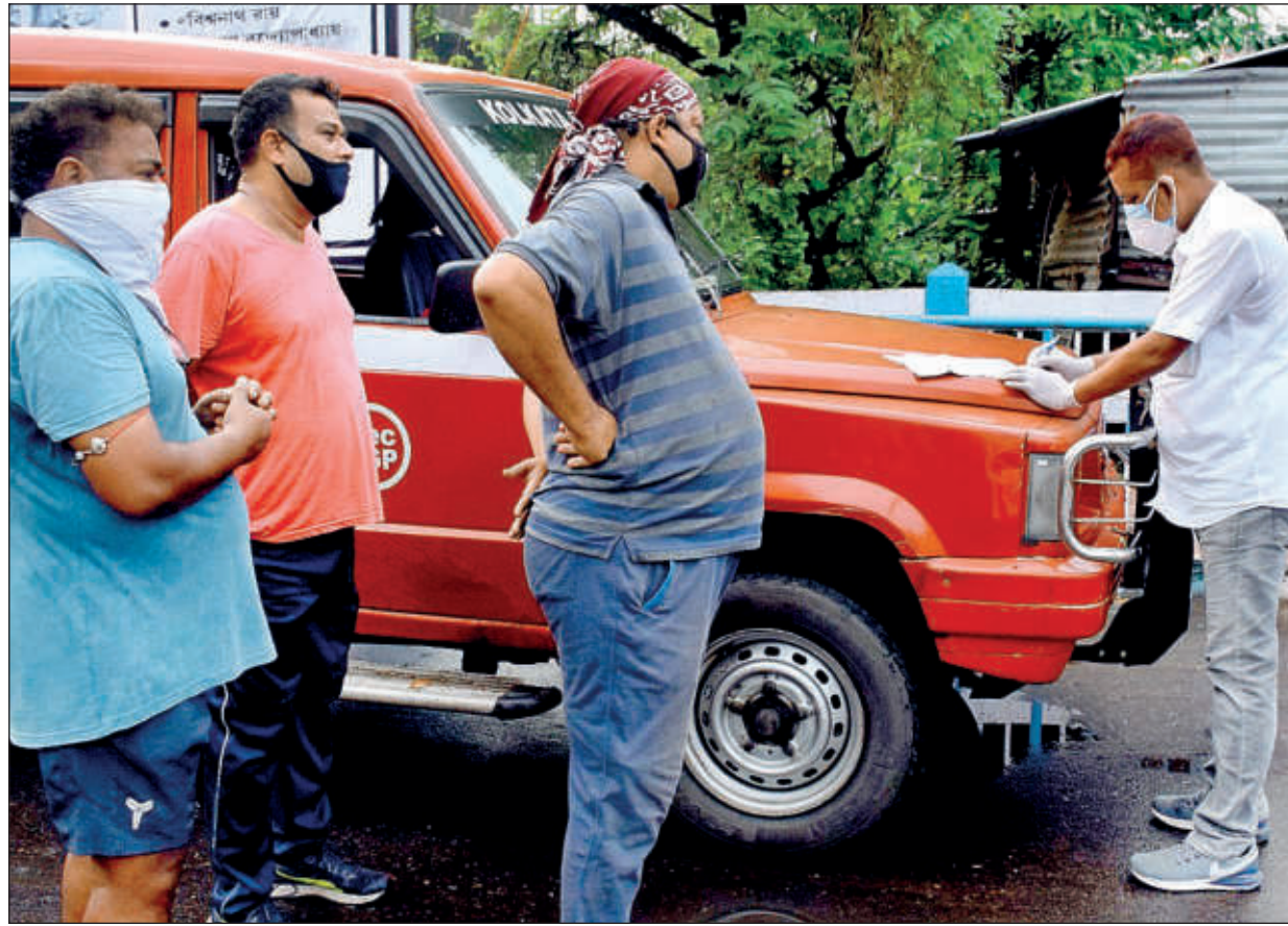
নিয়ম ভেঙে গাড়ি বের করার জরিমানা করছে পুলিশ। কুঁদঘাটে, বৃহস্পতি।

গত সপ্তাহের দুদিনের মতো এসপ্তাহে বৃহস্পতিবার লকডাউনও সম্পূর্ণ সফল। বস্তুত, বৃহস্পতিবার লকডাউনের কলকাতা এতটাই ঘরবন্দী ছিল, যা আগে দেখা যায়নি। কলকাতার পার্শ্ববর্তী জেলাগুলির লকডাউনও যথেষ্ট সফল। তবে, উত্তর ও দক্ষিণবঙ্গে কয়েকটি জেলায় দু'চারটে বিক্ষিপ্ত ঘটনা ঘটেছে। পুলিশ কঠোর হাতে ব্যবস্থা নিয়েছে। পরের সপ্তাহে লকডাউন হবে ৫ আগস্ট, বৃহস্পতি। কলকাতায় লকডাউন ভাঙার জন্য সারাদিনে ৭২১ জনের বিরুদ্ধে ব্যবস্থা নিয়েছে। মাস্ক না পরার জন্য ধরা হয়েছে ৩৫২ জনকে। গাড়ি বাজোয়া হলে ৩০টি। যত্রতত্র থুতু ফেলার জন্য মামলা হয়েছে ২১ জনের বিরুদ্ধে। বৃহস্পতি সন্ধ্যা থেকেই কলকাতার বিভিন্ন থানা এলাকায় পুলিশ টহলদারি ছিল। কোথাও কোনও জমায়ত বা আজ্ঞার ঘটনা ঘটেনি। সকাল সাড়ে ৮টায় অমহাস্ট্র স্ট্রিট, সাউথ-ইস্ট ডিভিশনের কয়েকটি থানা এলাকায় ড্রোন উড়িয়ে লকডাউনের পরিস্থিতি দেখা হয়। এরপর পর্যায়ক্রমে সকাল ৯টায় বড়বাজার, গার্ডেনরিচে। বিকেল সাড়ে ৩টায় শ্যামপুর, ফের সাউথ-ইস্ট ডিভিশনের কয়েকটি থানা এলাকায় ড্রোন ওড়ানো হয়। বিকেল ৪টায় মুচিপাড়া এবং দক্ষিণ বন্দর থানা এলাকায় ড্রোন উড়িয়ে পরিস্থিতি দেখা হয়। গিরিশ পার্ক, পার্কসার্কাস, পার্ক স্ট্রিট, মেটিয়াবুজ, শ্যামবাজার, রোড রোড, বিটি রোড, ডায়মন্ড হারবার রোডে দেখা যায় একেবারে জনশূন্য। সকাল থেকেই ট্রাফিক বিভাগের সহকারী কমিশনাররা রাস্তায় ছিলেন। বিভিন্ন ট্রাফিক গার্ডের ওসি ও অন্যান্য অফিসার, সার্জেন্টরা টহল দিয়েছেন সর্বমুঠ এলাকাগুলিতে। স্থানীয় থানাও নজর রেখেছে পরিস্থিতির ওপরে। যুক্তিযুক্ত কারণ